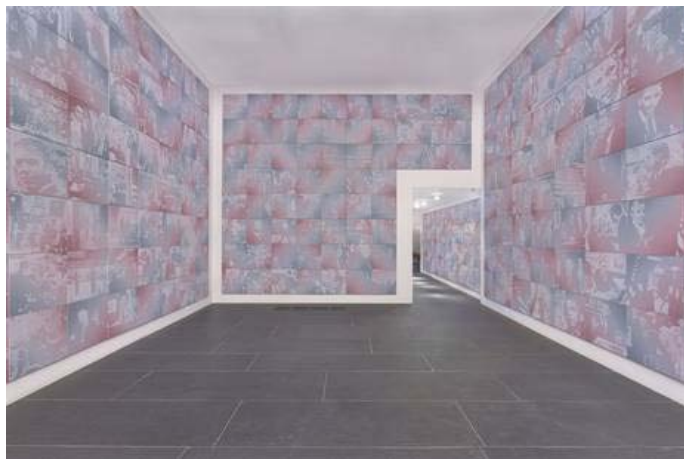
Installation detail from the Obama paintings