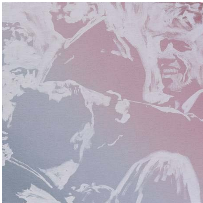
Installation detail from The Obama Paintings

"I don't think he has let me down any more than he has let himself down," he said.